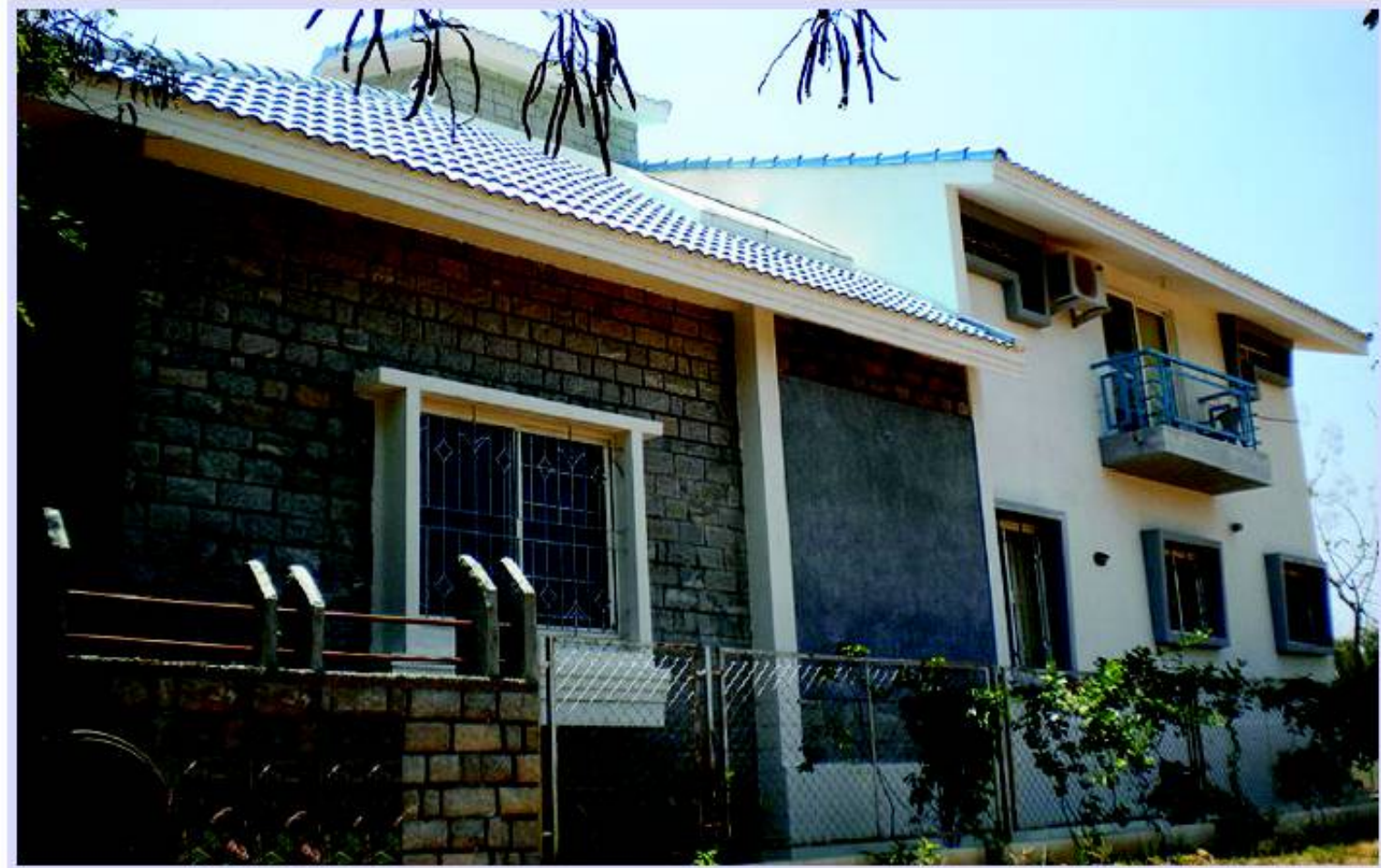
A traditional facade for an ethnic look

While the facade is quite traditional in character, the layout is that of a contemporary house. "The concept of simple living is captured very well. The three-level design allows plenty of private space and easy access to all rooms. The atrium effect gives you a feeling of larger space and brightness," says Younus.